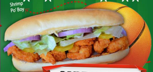
Shrimp Po' Boy